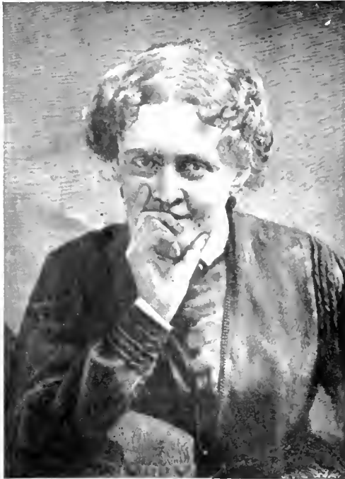
HELEN MARIA FISKE JACKSON.

JACKSON, Mrs. Helen Maria Fiske , author, poet and philanthropist, born in Amherst, Mass., 18th October, 1831, and died in San Fran-